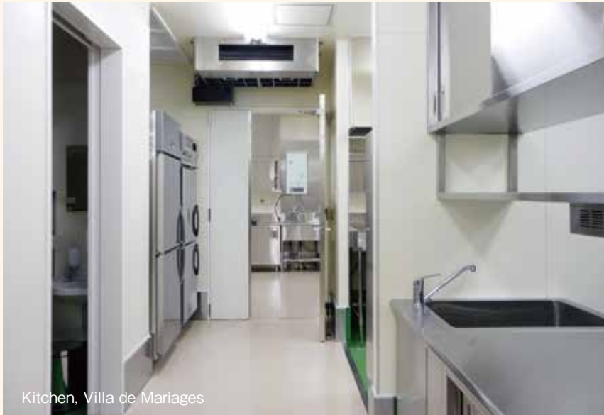
Kitchen, Villa de Mariages

Standard color noncombustible certification number NM-3455 (Stendo#500/T/MR) Customer color noncombustible certification number NM-4486 (Stendo#500/T/MR) Noncombustible certification number NM-3456 (Stendo#500S)